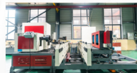
自动装配流水线 Automatic assembly line