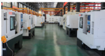
全自动智能生产线 Automatic intelligent production line