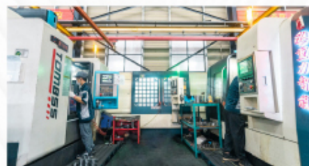
组合生产线 Combined production line