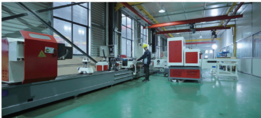
无尘恒温装配车间 Dust-free thermostatic assembly workshop