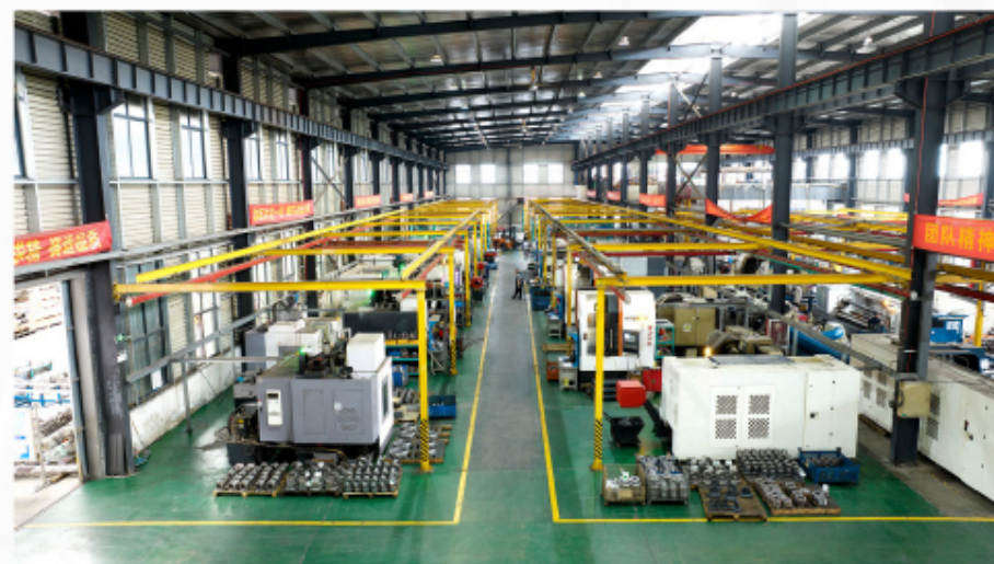
小件生产线 Small parts production line