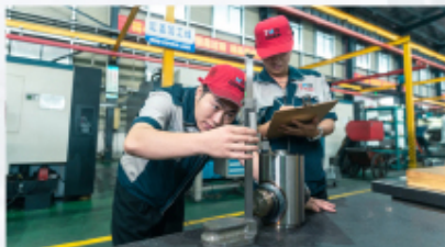
过程检验 Process test