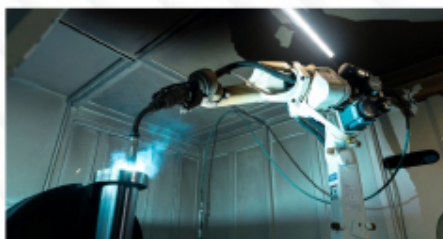
机械手焊接 Manipulator welding

Advanced manufacturing and processing capabilities