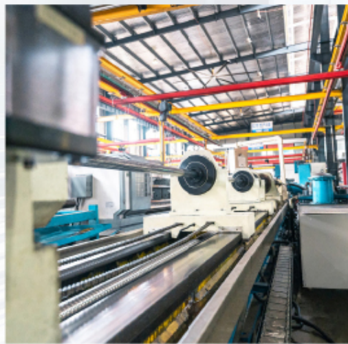
油缸内孔刮削滚压设备(SR&B) Cylinder hole scraping and rolling equipment (SR&B)