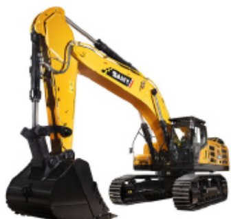
挖掘机油缸 Excavator cylinder