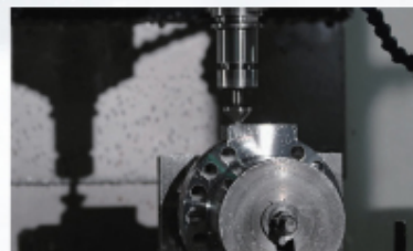
零部件加工 Parts processing