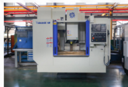
加工中心 Machining center