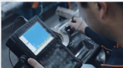
超声波探伤 Ultrasonic inspection