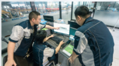
技术部讨论 Technical department discussion