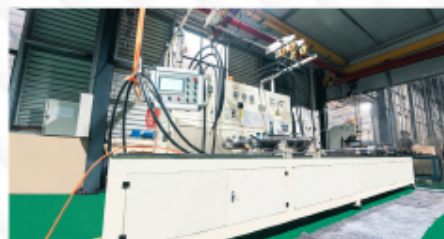
试压机 Pressure test machine