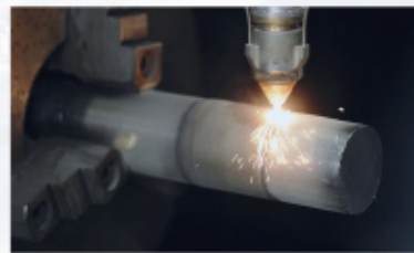
激光熔覆技术 Laser cladding technology