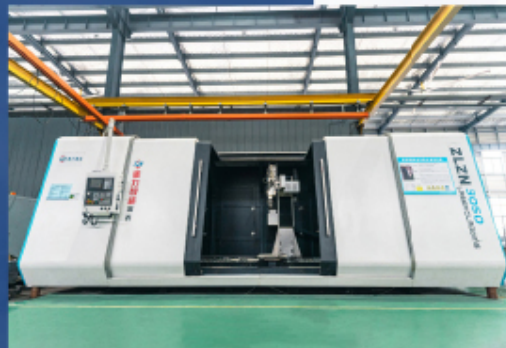
激光熔覆机 Laser cladding machine

Our company has advanced processing equipment: Cylinder hole scraping and rolling equipment (SR&B), vertical four-axis machining center, horizontal machining center, laser cladding machine, welding robot, shot blasting machine, polishing machine, CNC automatic welding machine, ultrasonic cleaning machine, automatic painting production line, automatic assembly line, fully automated product production line and other special equipment. The manufacturing process of all kinds of cylinders has formed a unique Zhongming characteristic.