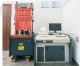
万能试验机 Universal testing machine