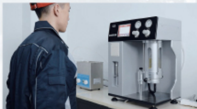
油液颗粒计数器 Oil particle counter