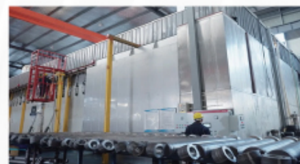
自动涂装生产线 Automatic coating production line