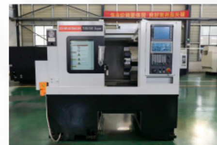
数控机床 Numerical control machine tool